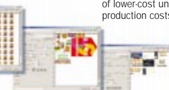
• Auto Layout