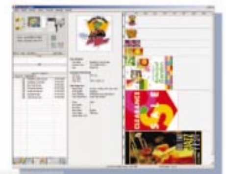
• VersaWorks' main menu