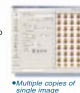
• Multiple copies of single image